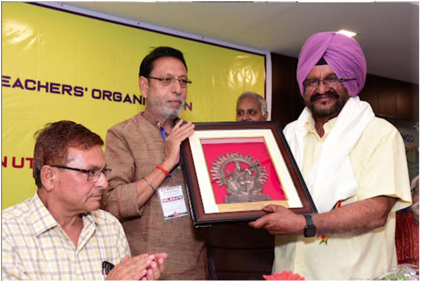
FELICITATION TO OUT GOING PRESIDENT-8