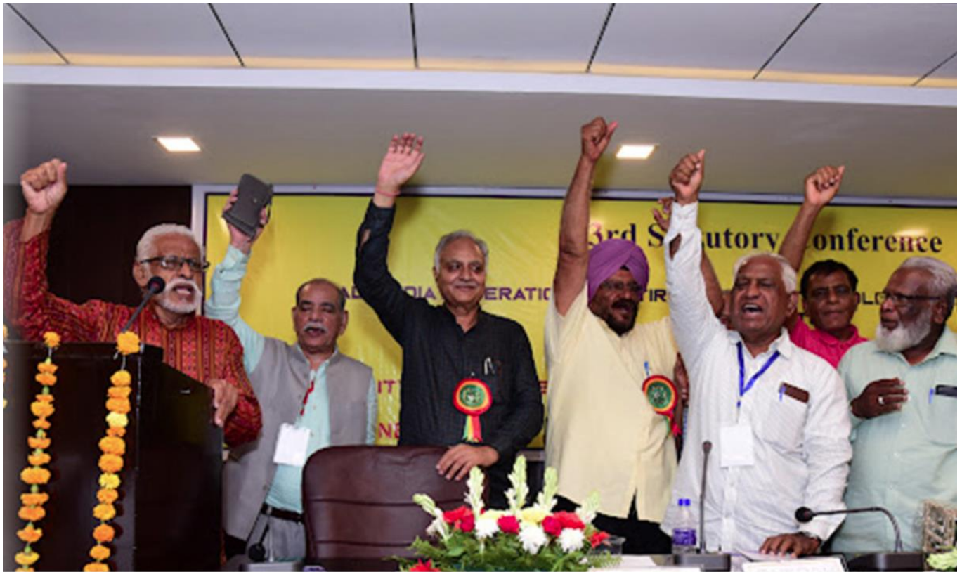
LONG LIVE AIFRUCTO