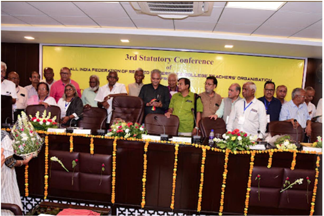
ELECTED TEAM FOR AIRFUCTO FOR THE NEXT 3-YEARS