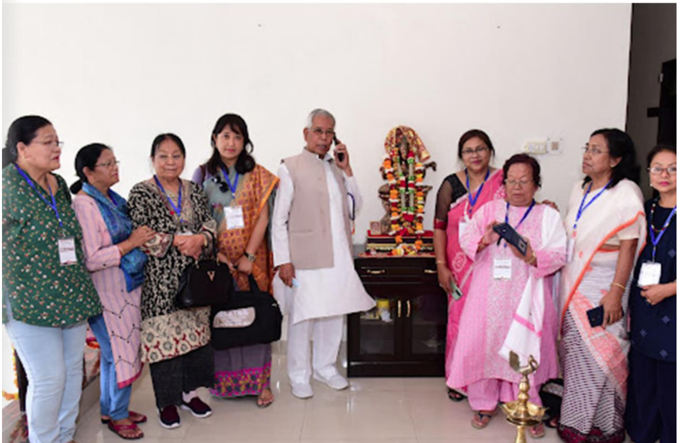
MEMBERS OF NORTH EAST STATES