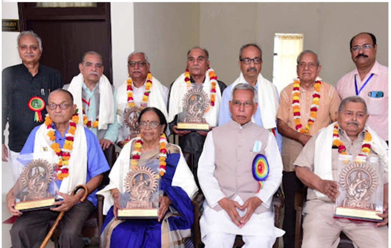
FELICITATION TO SENIOR MOST TEACHERS