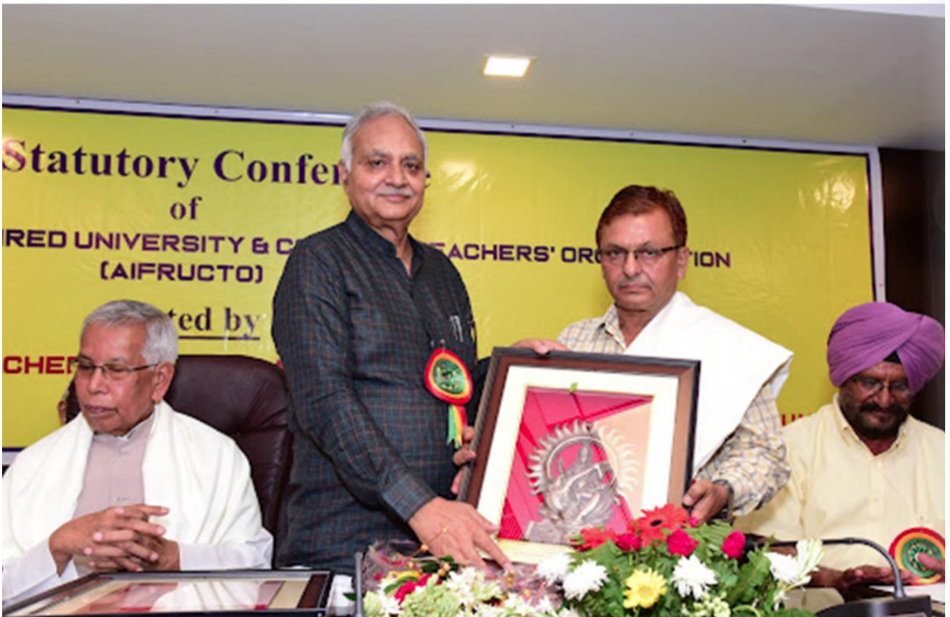
FELICITATION TO AIFUCTO GEN.SECRETARY