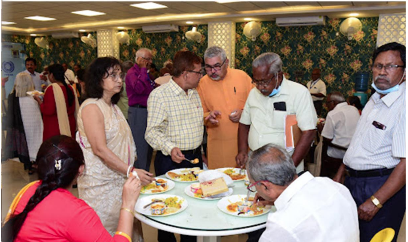
AT DELECIOUS LUNCH