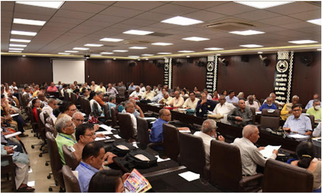
AT ONE ANGLE VIEW OF AUDIENCE IN THE CONFERENCE