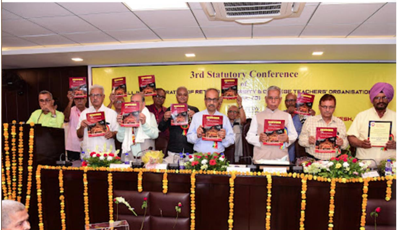
SOUVENIR RELEASE -4