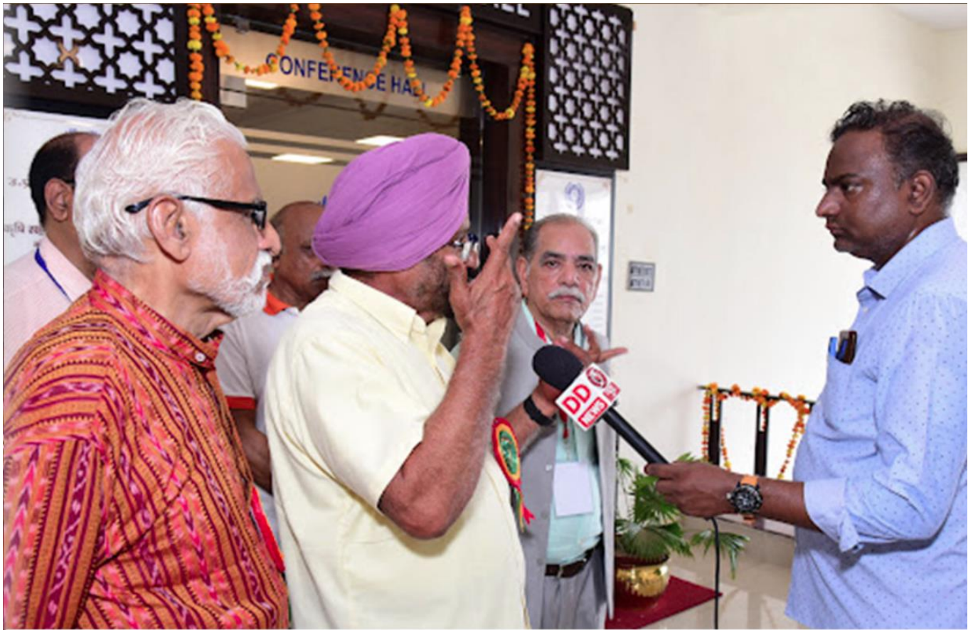
PRESS CONFERENCE BY OUR OUT GOING PRESIDENT AND GEN.SECRETARY