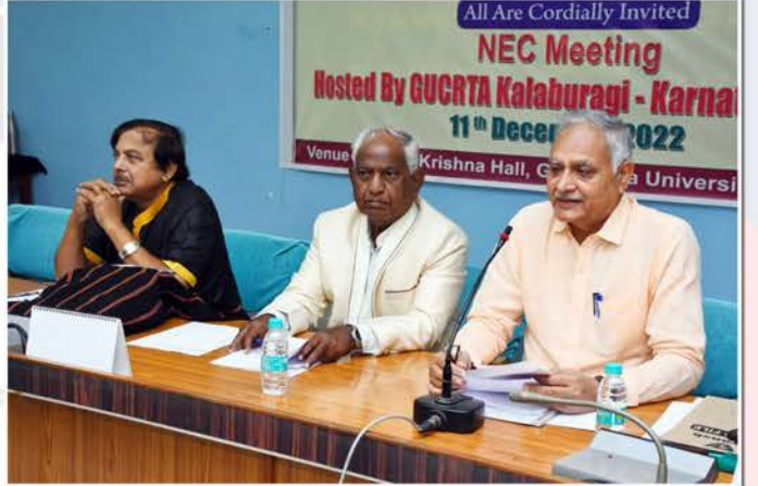
THE MAIN PRESENT PILLERS OF AIFRUCTO