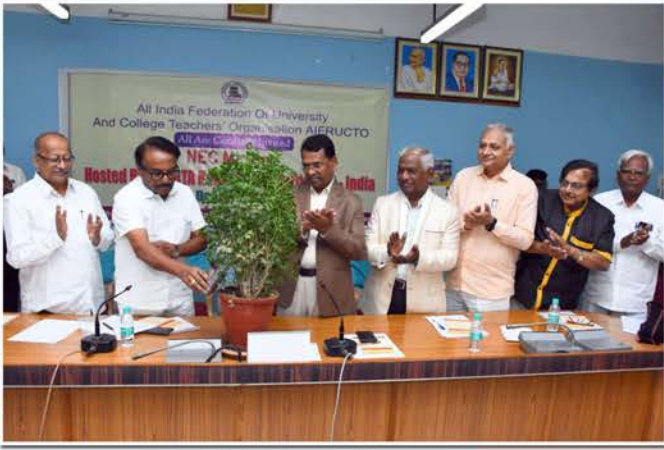
NEC MEETING AT GULBARGA INAUGURATED BY SRI SHASHIL NAMOSI, MLC BY WATERING THE PLANT.